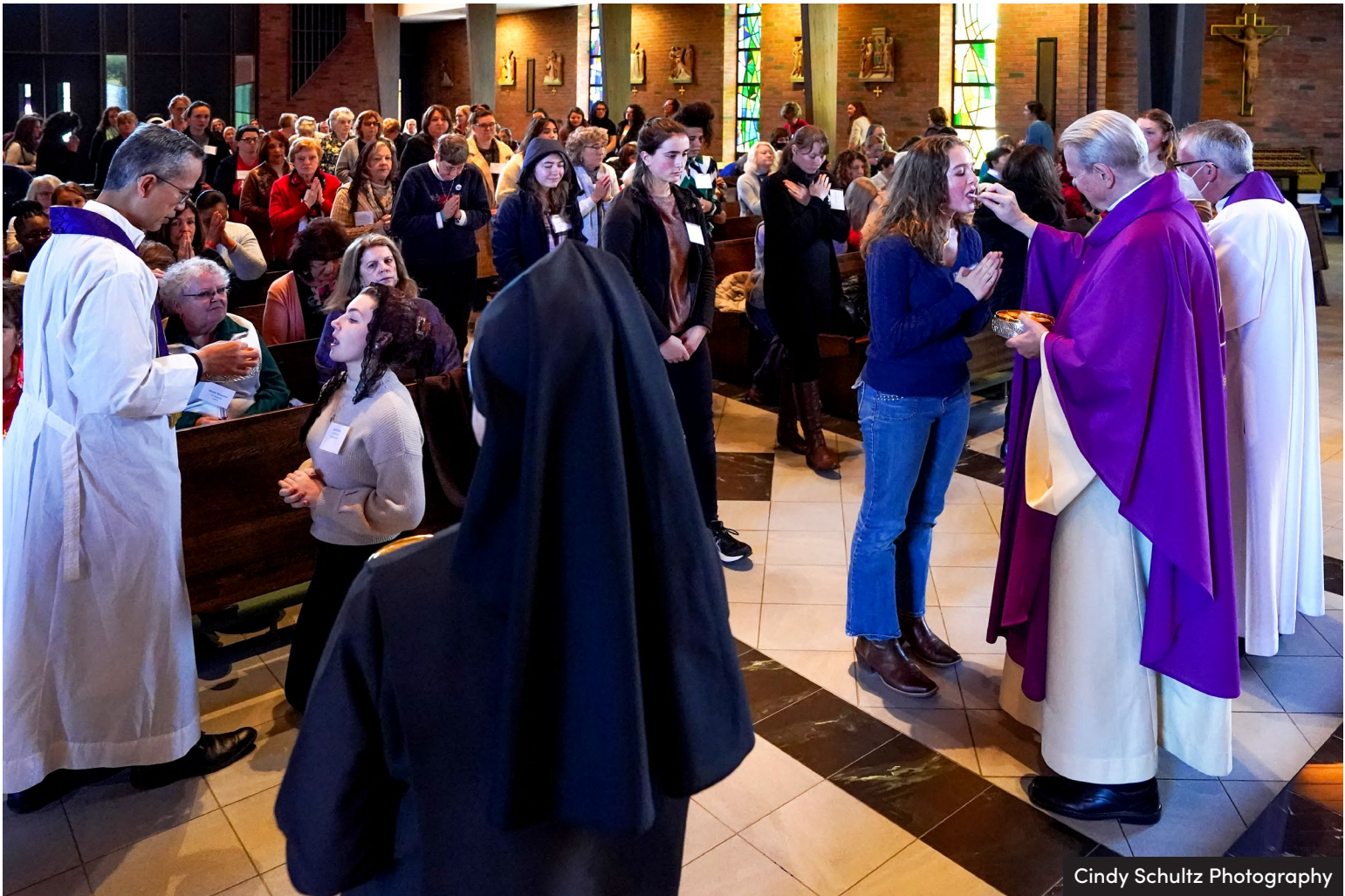
Cindy Schultz Photography